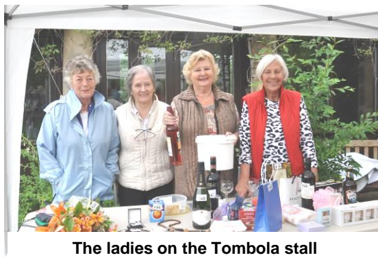
The ladies on the Tombola stall

That's the sum raised to date – there may be a little more to come. Despite the bad weather many people turned out to enjoy this annual event which takes place by kind permission of the Brothers of the Society of St Francis. There are still some raffle prizes to be claimed – please see the Hindmarsh Hall notice board.