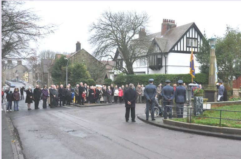
Service of Remembrance, Sunday, 13 November